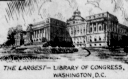
THE LARGEST— LIBRARY OF CONGRESS, WASHINGTON, D.C.

SINCE THE 1760s WHEN THE COLONIES ALREADY HAD 23 PUBLIC LIBRARIES AMERICA HAS TOPPED THE WORLD WITH THEM—SOME 112 MILLION VOLUMES TODAY.