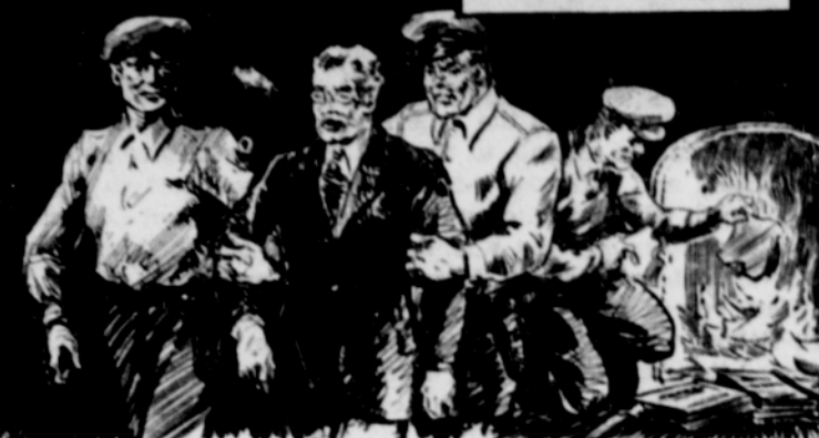
THE MERE READING OF A BOOK OR NEWSPAPER NOT DICTATOR-APPROVED MEANS SWIFT AND CRUEL PUNISHMENT.

mater To drive the ducks down to the water! —E.S.W.