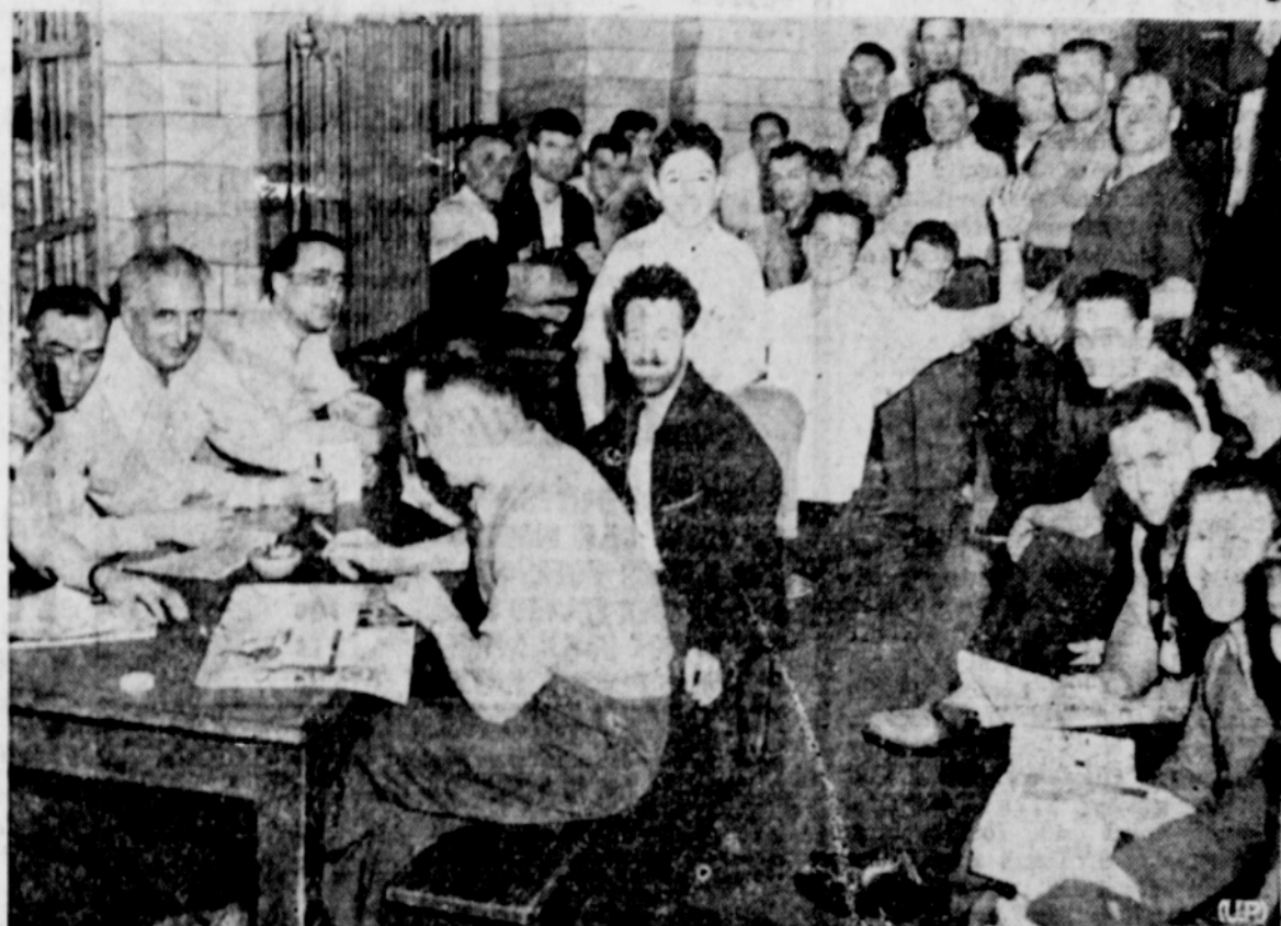
These crewmen of seized Italian motorship Leme, who idle away time in Seattle jail, will join hundreds of other German and Italian seamen at new detention camp being prepared at Missoula, Mont., for the "duration."