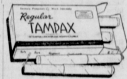
Cottage Grove Pharmacy