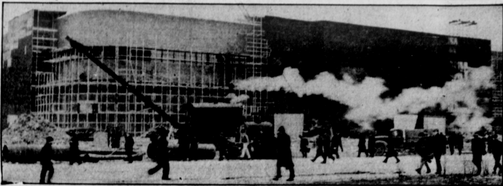
WORKMEN have begun tearing down the huge fibre board shelter inside which the $21,000,000 Ford airplane engine plant has risen in the dead of winter at Dearborn, Mich. Shown above is part of the first section of the plant, which will be completed during the next week. The entire plant will be completed late in March—little more than six months from the time ground was broken—and will be in production in April.