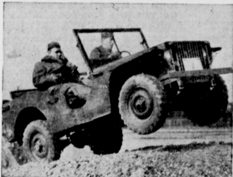
Speed shot at Camp Holabird, Maryland, during tests on new Light Reconnaissance and Command Cars for United States army. They carry machine gun and crew of three men at approximately 60 miles an hour. Can climb steeper hills than tanks. The Ford Motor Company, which built the ditch-jumper shown above, has an army order for 1500 of these units.