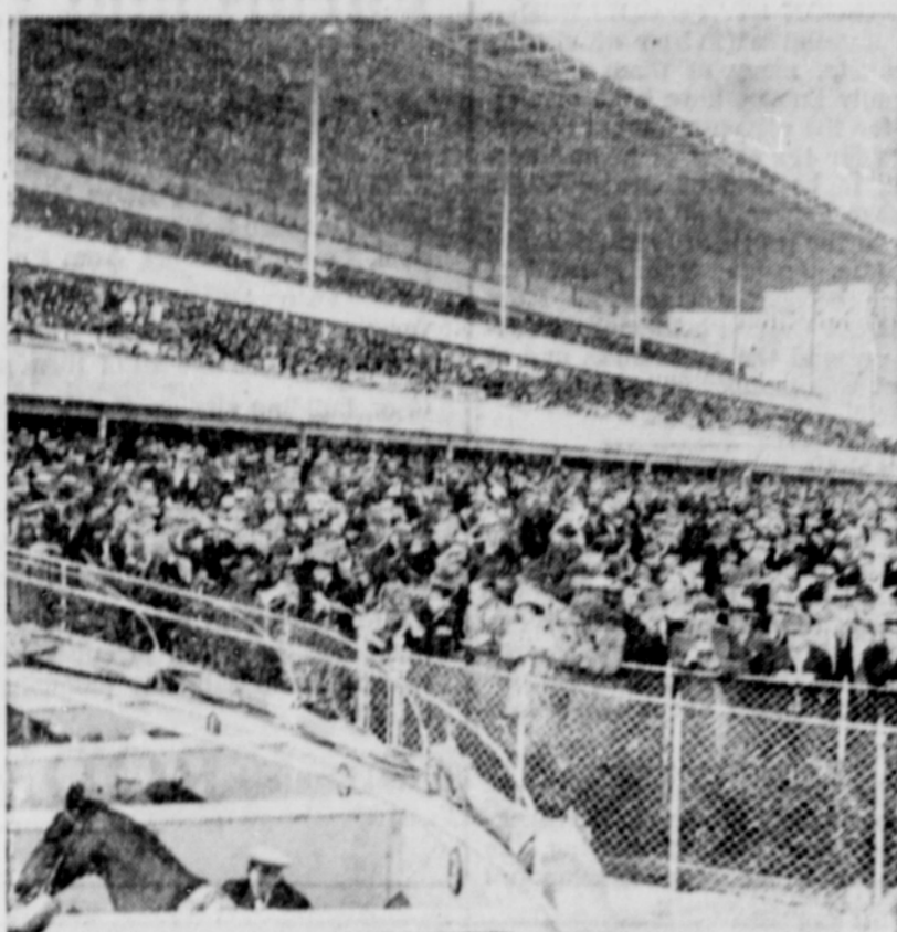
Here's part of 20,000 who thronged opening of new two-million-dollar race track at Albany, Cal. Opening of track was delayed by protracted rainy season but when it did open the crowd didn't bet much. Operators hope to coax dollars out of wallets as 33-day season progresses.

business—or on a pro-rata basis where used less than half the time for pleasure. This has been construed to cover insurance costs.