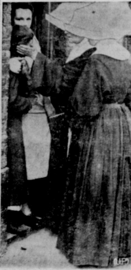
People of peace, these nuns console women who lost loved ones in Nazi air raid on London. Passed by British censor.

Still Use Ice Despite widespread use of mechanical refrigerators, Americans still consume 40,000,000 tons of ice annually.