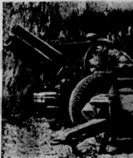
These Australians find haystack, somewhere in England, conveniently located for hiding anti-aircraft gun. They are awaiting blitzkrieg from skies. Let Nazis come, they say.