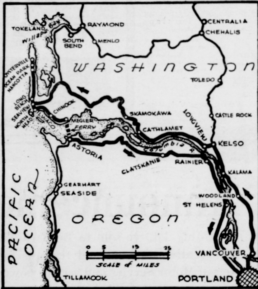
The route down the North Bank highway to the peninsula and back up the south side is mapped here.

The return route from Astoria was eastward up the Columbia over the paved Lower Columbia River highway, a distance of 105 miles.