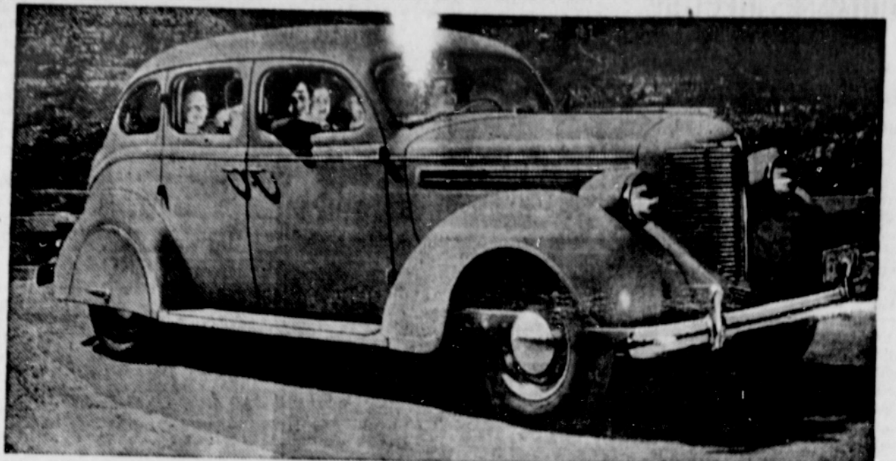
The Chrysler Royal four-door touring sedan. It has a wheelbase of 119 inches and a Gold Seal engine developing 95 horsepower. A completely new front end treatment and many new features make it the finest car in the price class that Chrysler has ever offered.