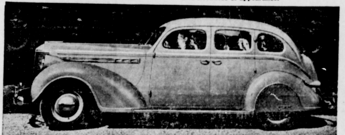
The Chrysler Imperial four-door touring sedan. On a wheelbase of 125 inches and with an engine developing 110 horsepower, this car offers remarkable performance with good economy. It brings luxurious motoring into the moderate price field.

Radical changes in exterior appearance, greatly refined and beautified interiors, larger and more powerful engines of improved design, longer wheel bases, larger hydraulic brakes and a score of mechanical refinements and improvements feature the two new cars comprising the Chrysler line for 1938. These cars again are designated as the Chrysler Royal and Chrysler Imperial respectively.