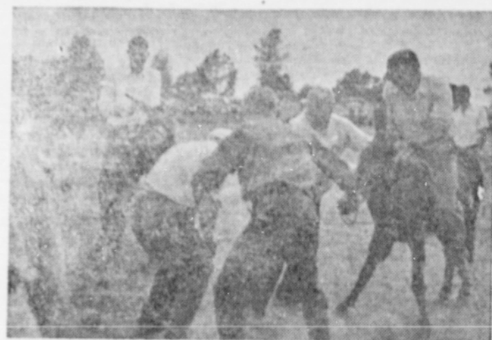
Dizzy Dean being held up at third. Donkey is trained not to cross white line.