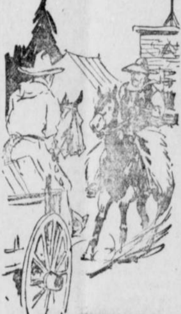
There, Coming Along the Pavement Toward Me, Was Marshal McGrath.

(Continued from first page.) boy—mercurial, excitable, Celtic. "The boss is hurt—oh, the boss is hurt!" he gasped. I rushed inside. Marcus sat at his desk, head and back hunched over his arms. There was blood on the scattered papers. And then—he moved—moved, turned round, faced me. His nose was bleeding. So was a cut over his left eye. One side of his mouth was beginning to puff, but the other smiled. "He beat me up," said Marcus, "that dirty crook McGrath—he sneaked on me and got my gun and beat me up. Didn't kill me and didn't give me a chance to kill him—just beat me up. G—d, I feel relieved!" Had Town Marshal McGrath assaulted Marcus Handy on a day when the camp was booming along at its accustomed pace, the politics of Cottonwood might at once have