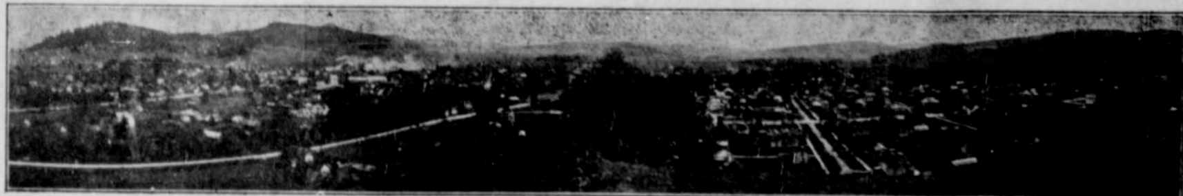
BIRD'S EYE VIEW OF COTTAGE GROVE FROM SUMMIT OF MOUNT DAVID.