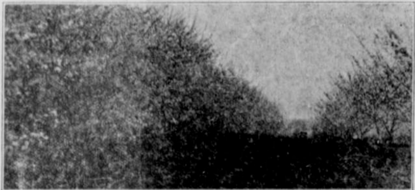
COTTAGE GROVE ORCHARD SCENE.