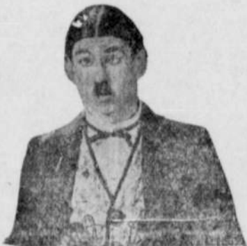
Big Movie Night