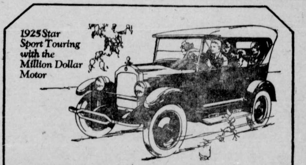
1925 Star Sport Touring with the Million Dollar Motor