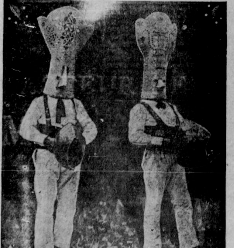
A quaint Christmas custom in carrying big cowbells—go about Switzerland. Twelve selected men bestowing Gifts and Happiness in wearing white suits, bright red neckties and frockish headgear and many Swiss homes.