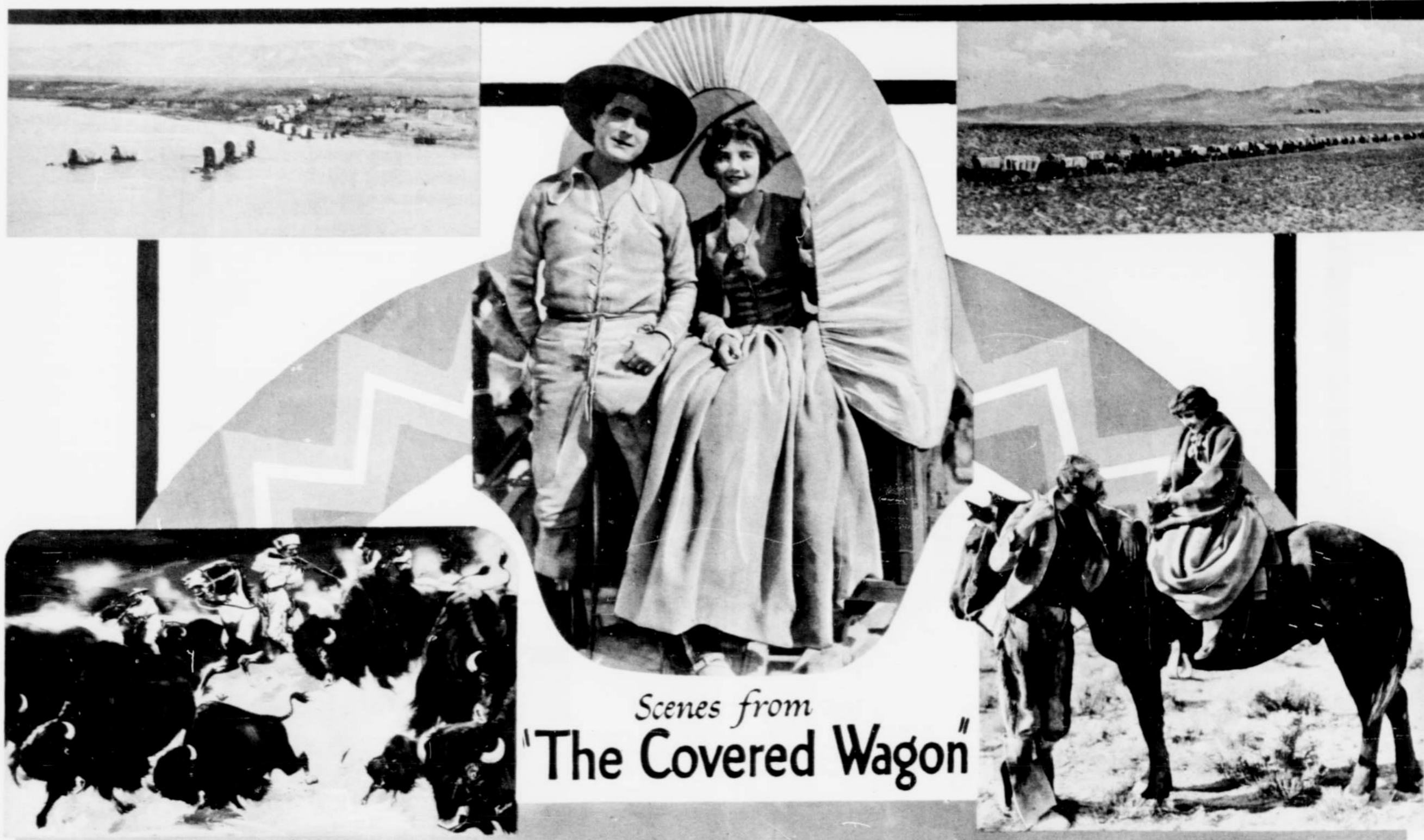
Scenes from "The Covered Wagon"

Book by EMERSON HOUGH Adaptation by JACK CUNNINGHAM Presented by JESSE L. LASKY A JAMES CRUZE PRODUCTION Paramount's great American romance