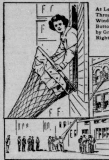
At Left: Start of Plunge Through Silk Tube from Window; Center: Men at Bottom Controlling Speed by Grip on the Net Cover; Right: A Slide to Safety.

For saving the lives of persons trapped in burning buildings, a long, silk tube, inclosed in strong netting, has