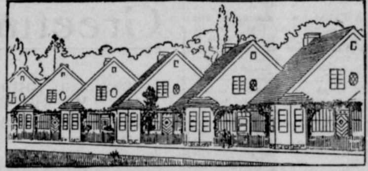
Small Dwellings Set at Angle to the Street to Give More Light and Air and Greater Security against Intrusion: Heat and Electricity are Supplied from a Central Plant

Grafting a single cotton plant to the root of a mulberry tree has produced 900 bolls, or pods, where formerly 40 was a good crop. The process, an invention of a southern plant breeder, is being widely watched because of the possibilities it offers in reducing the cost of cotton. Some of these grafted plants are nearly 8 feet tall and have well-developed fibers, called staples. The production rate is greatly increased, three mother plants giving about 60 pounds of seed cotton, or four bales per acre.