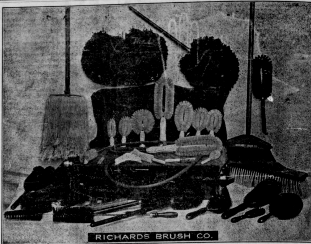
RICHARDS BRUSH CO.