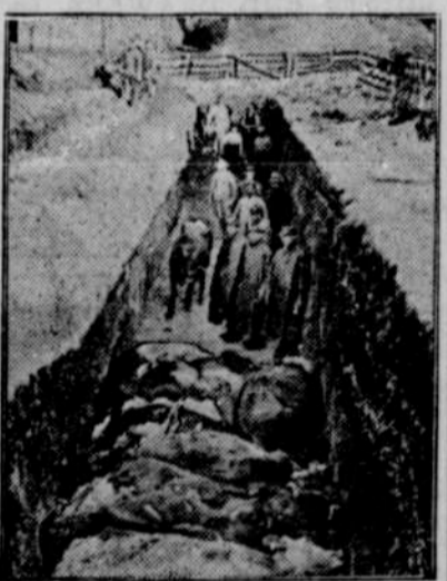
Deep Burial of Cattle Slaughtered to Prevent Spread of Foot-and-Mouth Disease.

Greatest Danger to Industry. But, perhaps, the greatest danger to the industry in this country lies in the presence of the disease in South America, Central America, and Jamaica.