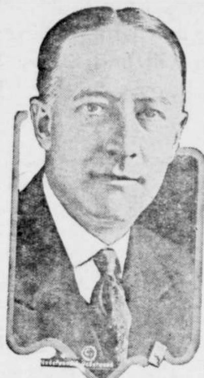
A. E. SMITH

New York has gone democratic by an unprecedented plurality for Al E. Smith, democratic candidate for governor, over Nathan L. Miller, republican incumbent. His plurality is estimated at 400,000.