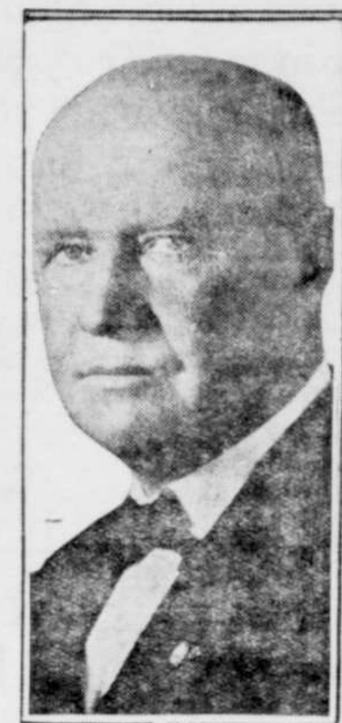
WALTER M. PIERCE

He apparently has carried Benton, Curry, Gilliam, Hood River, Klamath, Lake, Washington and Wheeler, while Pierce has all the other counties.