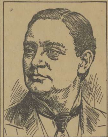
Senator Joseph W. Bailey.

Here is a story of the establishment of the first telegraph line and the circumstances surrounding Mr. Morse's efforts to get congress to appropriate money for the construction, as told by Senator Bailey, of Texas, in the senate.