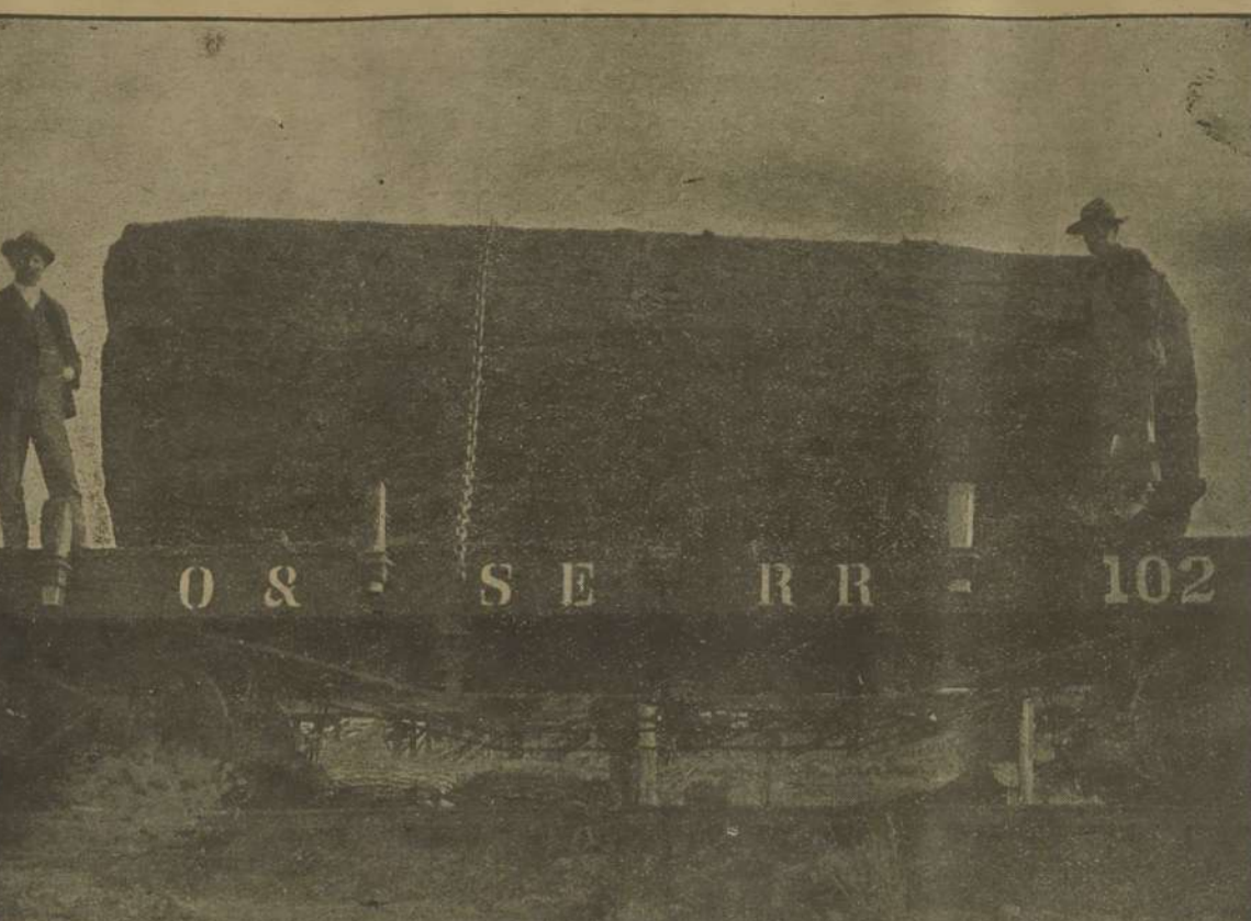
One of the big logs brought to a Cottage Grove Sawmill.

No matter how shaped or schemed, Oregon's timber wealth cannot depart the state without leaving in its stead approximately $4,800,000,000 gold, if current lumber prices prevail. But lumber is going up in value. Prices in the Northwest will be much greater in another ten years. The measure of gold given Oregon before another decade passes, for her forest resources, will mean that the state gets in return for the total present stand something like $7,000,000,000.