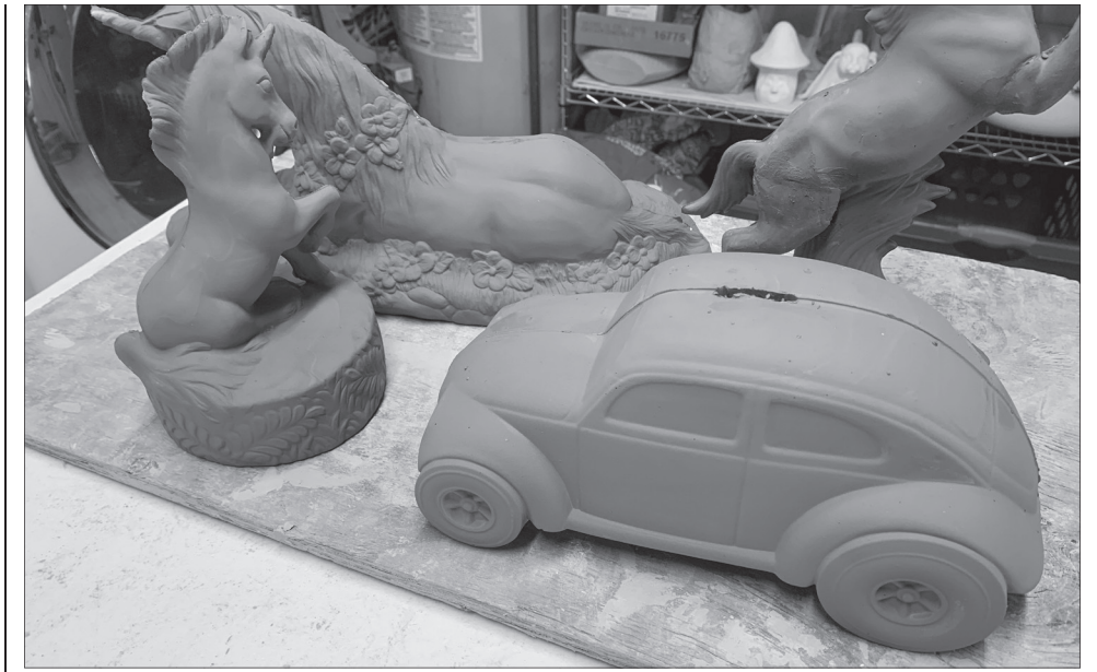
Sands Cupany in Cottage Grove makes 90% of its molds, which allows for more adjustments and personal touches. The owners are offering "Take-and-Paint" at-home projects.