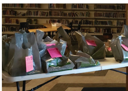
Bags full of library materials ordered online or by phone await 'curbside' pick-up. CRESWELL LIBRARY

To place an order by each week's Tuesday deadline, log in to the library catalog from the library's website