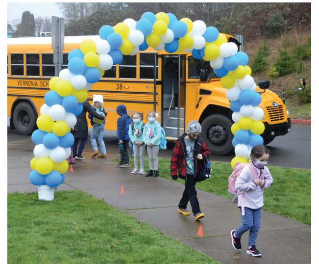
Vernonia Schools welcomed back kindergarten through 2 nd graders for in-person learning on February 8, almost a year after COVID restrictions required distance learning.

While restrictions are being relaxed it's still important to continue to follow good practices: face coverings, frequent hand washing, and physical distancing.