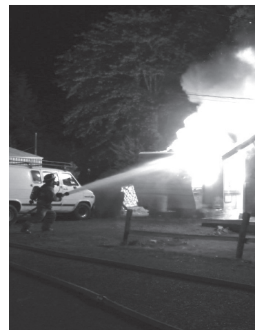
Here's What We Do!