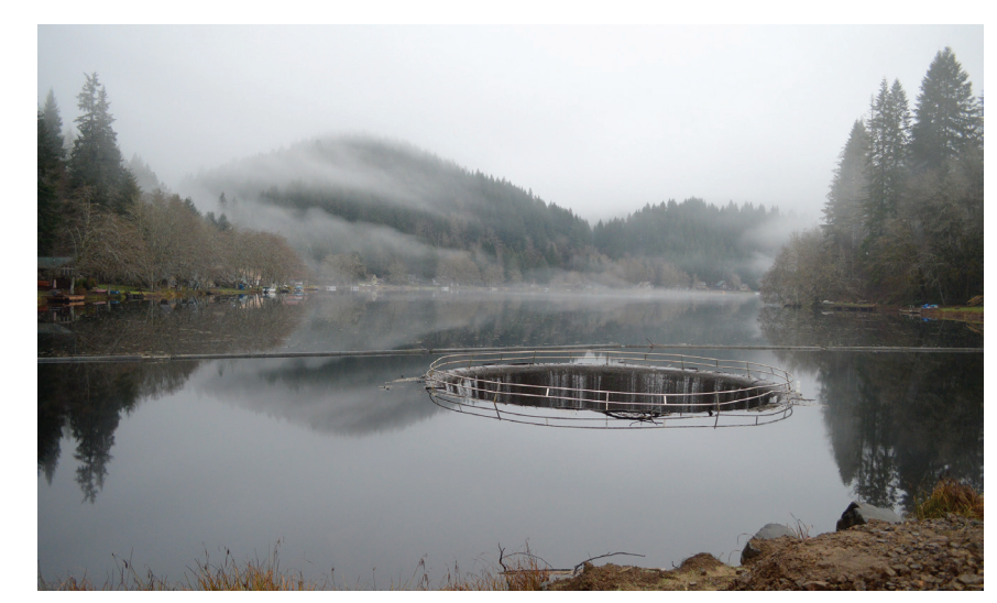
The Fishhawk Lake Reserve & Community was investigated by Oregon DEQ, and other state agencies after the release of water damaged water quality and aquatic life in Fishhawk Creek below the Lake.

The projects were conducted by the Fishhawk Lake Reserve & Community (FLRC), the local homeowners association (HOA). According to Wirtis the FLRC failed to properly coordinate and obtain permits before beginning