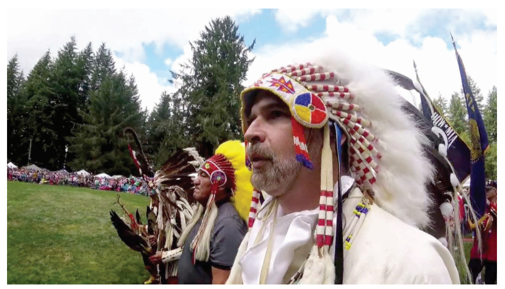
Warbonnet: An Odyssey Of Honor will be screened at the Clatskanie Film Festival on August 17.