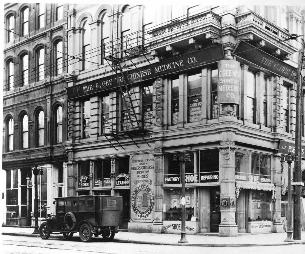
The West Coast Shoe Company started in Portland in 1918. This was one of their storefront locations at Morrison Street and 1st Avenue.

Following the war the company introduced a new service, one they still offer today, complete boot rebuilding, taking a well worn pair of trusty Wesco boots and replacing the heels, soles, laces, tongues and then reattaching the boot upper. For about one-third of the cost for a new pair of boots the original