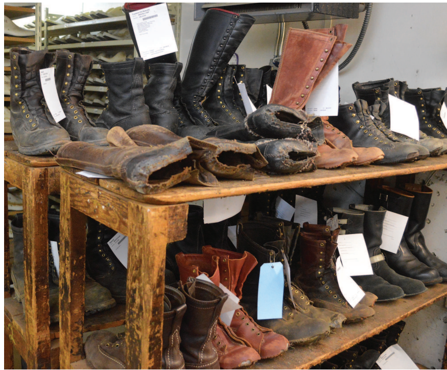
Wesco gives new life to their customers' worn out boots by rebuilding them from the sole up.