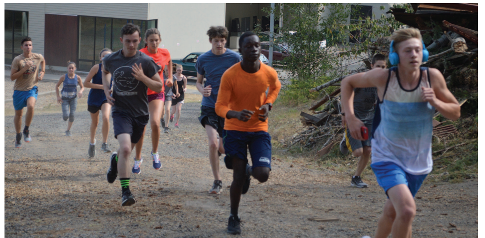
The Logger Cross Country team heads out for a practice run.

St. Mary's 48 th Annual Quilt & Crafts Fair