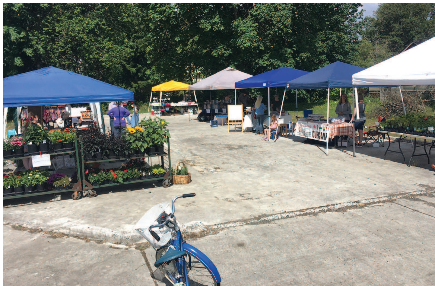
The Vernonia Open Air Market is settling into their new location at the corner of Bridge Street and Grant Avenue. The market is open Saturdays from 10:00 am to 2:00 pm.