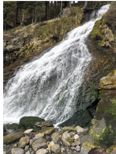
Blumenthal Falls at Smuggler's Cove

After playing on the beach or hiking up Neahkahnie Mountain, you've probably earned yourself a nice meal and maybe even a tasty beverage. You have plenty of choices in either Manzanita or Cannon Beach, or even back down the road in Nehalem. In Nehalem, my favorite spot is Garden Pizza, offering all