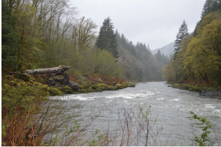
Lower Nehalem Road follows the Nehalem River through the Coast Range.

for Henry Rierson Spruce Run Campground. The first five miles of this road to the Spruce Run Campground is nicely paved, but then it turns into a single lane in places and eventually becomes gravel. Spruce Run is a very well maintained Oregon Forest Service campground and offers day-use areas which would make a great spot for a picnic breakfast; there are several other Forest Service picnic sites and camps along Lower Nehalem Road as well.