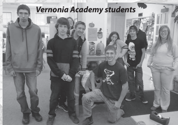
Vernonia Academy students