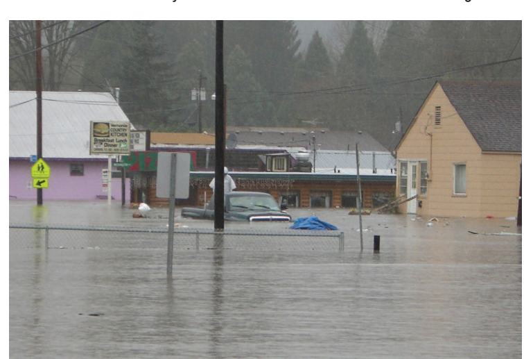
The flood on December 3, 2007 caused severe damage to homes,