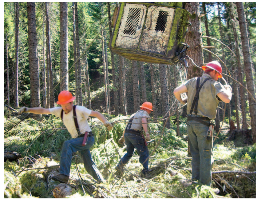
Loggers hard at work in the woods. August 2008