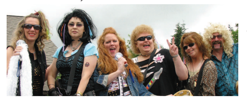
Employees of Wauna Credit Union on their float in the Jamboree Parade. September 2008