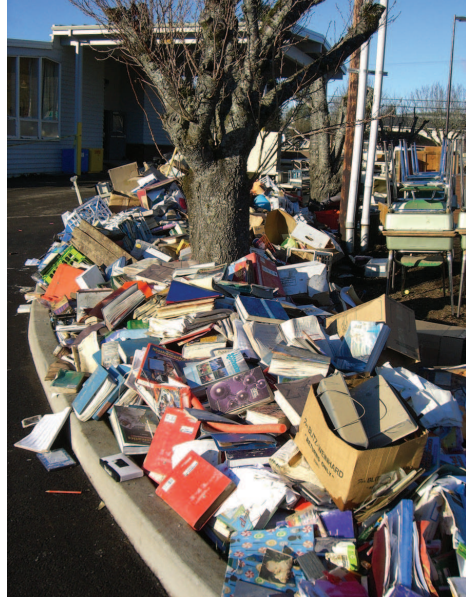
Remnants of the December 2007 flood that damaged all three buildings in the Vernonia School District. January 2008