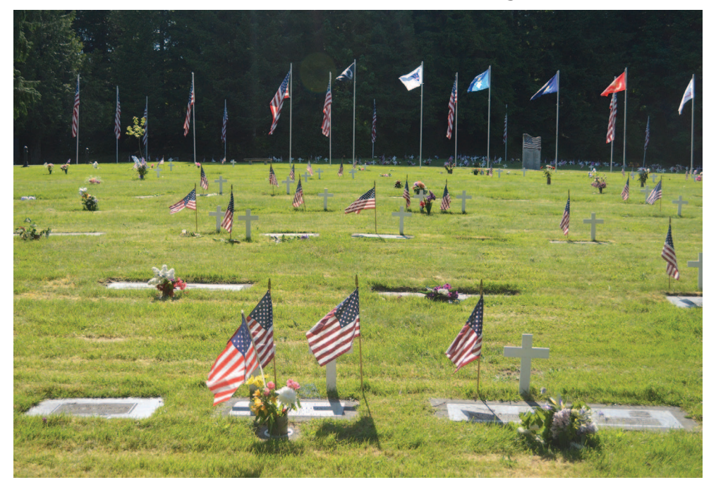
Memorial Day was observed on May 29 at the Vernonia Memorial Cemetery. The grounds were prepared by Scout Troop 860, the Vernonia Cemetery Committee, and other volunteers.