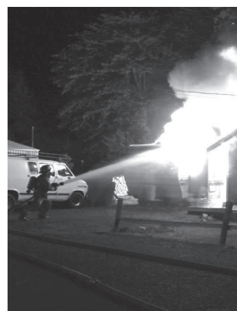
Here's What We Do!