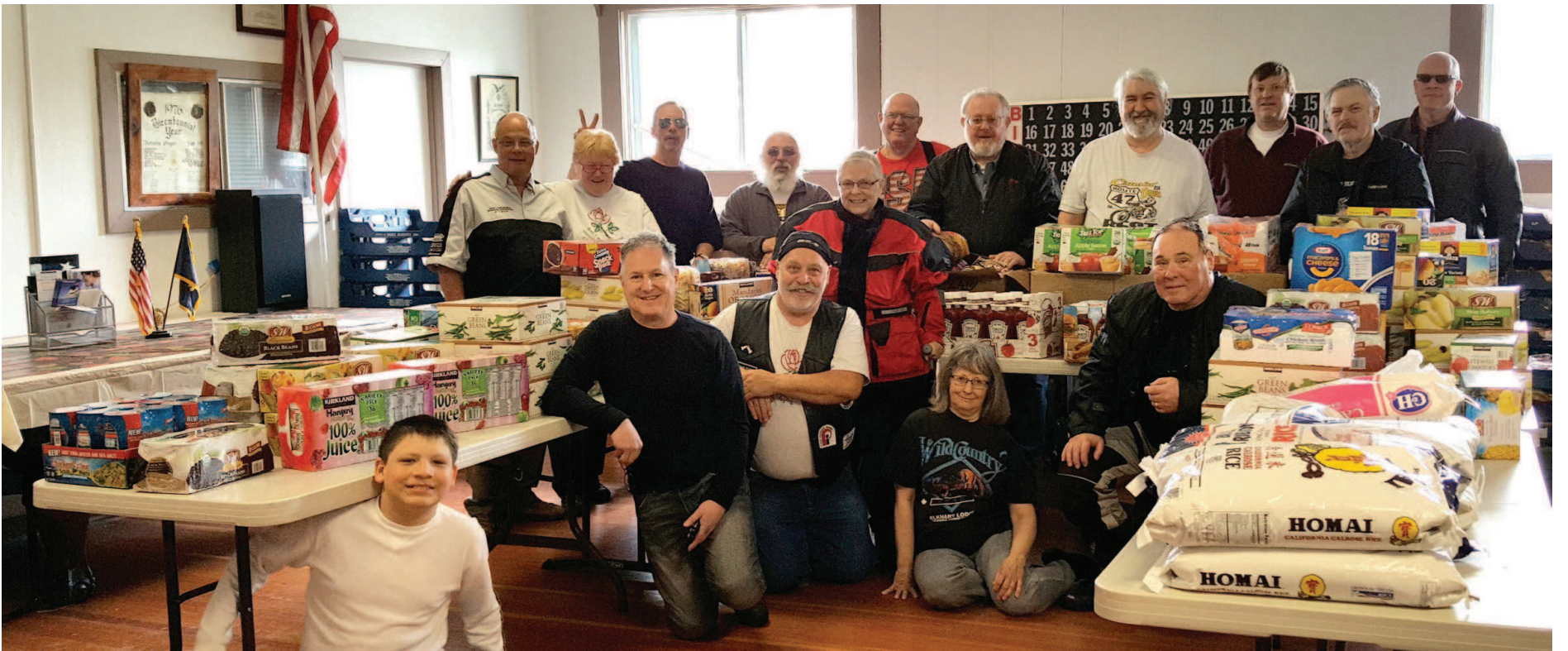
The Rose City Motorcycle Club arrived in Vernonia on June 18, 2016 with their annual donation to the Vernonia Cares Food Bank. The club delivered 1,196 pounds of food to Vernonia Cares. Thank you Rose City Motorcycle Club!