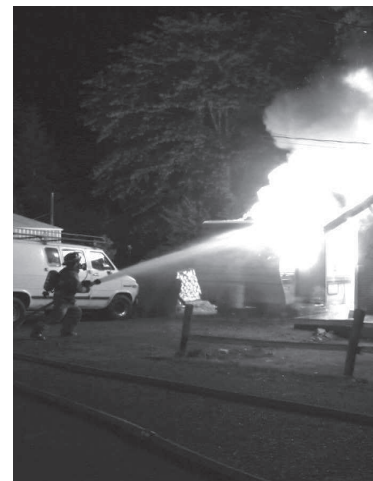
Here's What We Do!