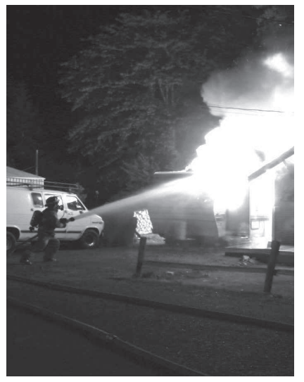
Here's What We Do!