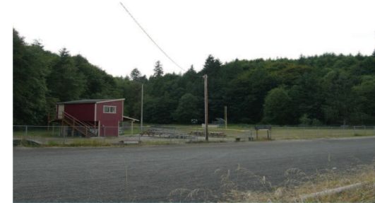
31+ Acres Timbered Development Land Hwy 30, Clatskanie, OR

Own a 25 ft waterfall with year around creek!! 7+/- acres zone Commercial General balance zoned for residential (MFR). About 4 acres of CG is cleared and currently used as baseball field, balance is in 25+ yr old reprod. City services available. 5 tax lots with frontage on Hwy 30 and 47. Offered at $795,000.