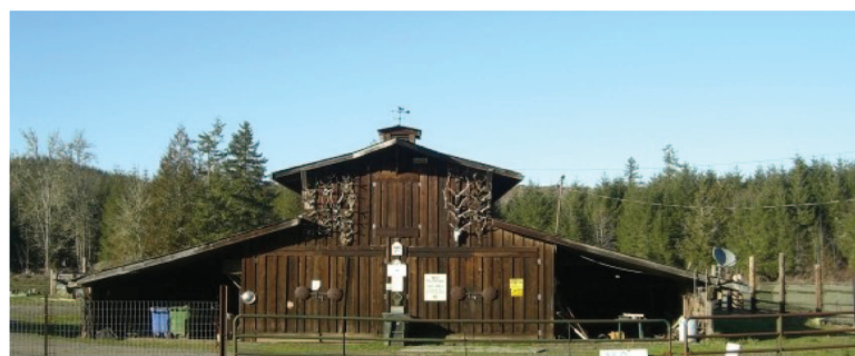
77.15 Acres Ranch 61281 Stoney Pt Road, Vernonia, OR

Approximately 20 acres in 25 yr old cedar and doug fir, balance in New Zealand fenced pasture. Perfect for most livestock. Logger strength access roads and graveled work areas. 40'x60' vintage barn with hay loft plus 24'x36' shed with concrete floor. Spring fed pond, gravity water system, 200 amp electrical service and phone-- no residence. Excellent deer and elk hunting, qualifies for 2 LOP tags. Antlers excluded. Offered at $425,000.