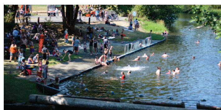
For more photos turn to page 19.