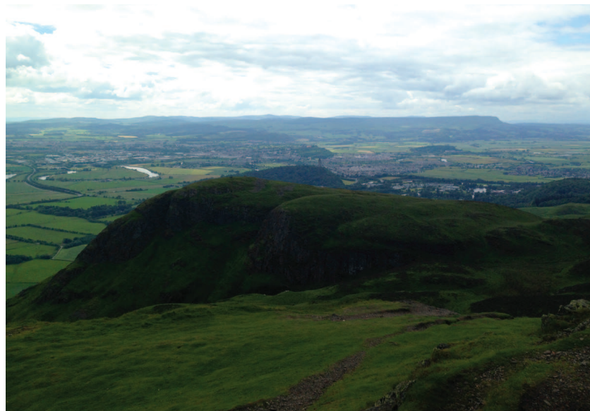
The view from Dumyat.

behind campus called Dumyat. We walked up beautiful green hills through sheep pastures to get to the top. Even though it was steep and exhausting, it was worth it for the views. At the top was a beacon that was full of stones which represent the wishes of everyone who had completed the hike. Apparently the beacon was placed there in 1977 as part of the Queen's jubilee.