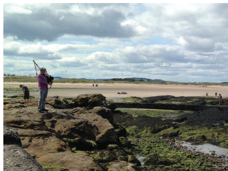
A bagpiper on the beach at St. Andrews.