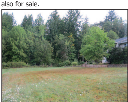
$40,000 Cherry Street Lot Great Setting with Views - Large .31 acre lot with views and seclusion! Ready to build. Backs up to woods. You'll like this one!