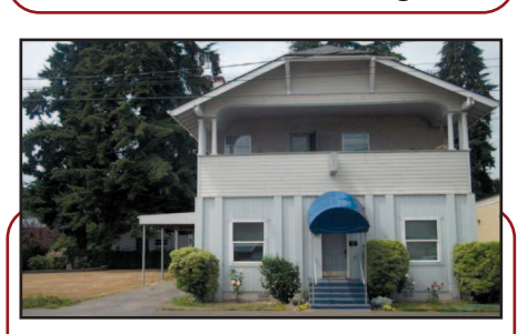
4526 sq.ft. Commercial building in a great downtown location. Don't miss out on this great opportunity. RMLS# 13184828 $159,900