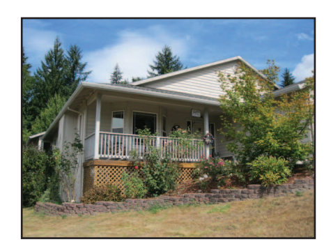
1372 E. Cherry Street $299,500 CUSTOM HOME - 4 Bdrm 2 Bath 2737 s.f. Light & Bright, vaulted ceilings. 3 Car Garage. Cozy gas fireplace in L.R. Custom cabinets throughout. Huge walk-in pantry. Gourmet kitchen w/island opens to formal dining room. Covered porch & patio. Private setting. .37 acre with adjacent lot