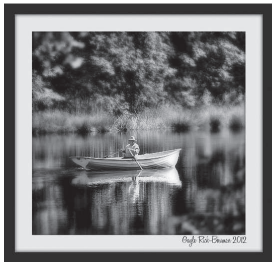
Gayle Rich-Boxman 2012

or herons flying directly above you or see a fish jump right in front of you. It is good exercise for both your body and your soul. There are times when it will feel like Fishhawk Lake is all yours and yours alone!