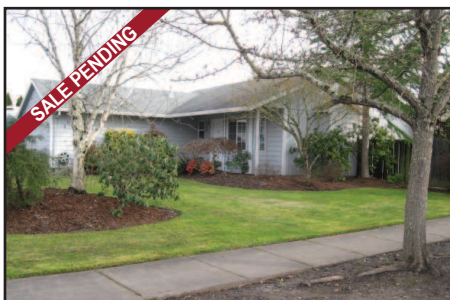
221 S. Nectarine St. Cornelius $169,500 Light & Bright Open floor plan, vaulted, beautiful finishes. Carpet & flooring 2 yrs new. French doors off master bdrm. Raised garden.