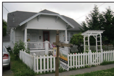
458 A Street $118,000 Doll House Cute! - Charming bungalow with white picket fence, recent updates with period charm. Clean & bright. Detached garage/shop.