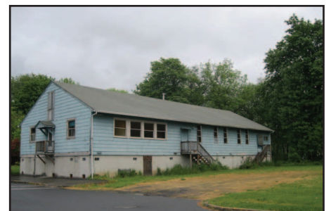
700 Adams Avenue $129,900 Many possibilities await! - 5060 sq.ft. Wooden beams, divided rooms. Pristine Rock Creek frontage. Bring your imagination!