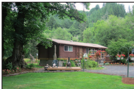
18621 Oblack Lane $199,000 Cozy cabin - 4.02 acres with sweeping views, river frontage (did not flood), extensive solid cedar walls. Recent remodel, newer roof & septic. Nicely landscaped.