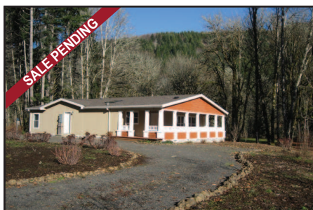
18619 Oblack Lane $259,000 Park-like setting in this 4.45 acre river front property. Did not flood. 3 bedroom, 2 bath, 2296 sq.ft. manufactured home.