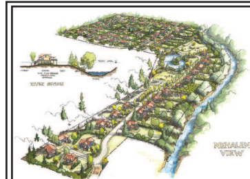
Mellinger Rd. $549,000

On a clear day you can see forever - 23 acres, 3 bdrm, 2 bath