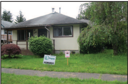
175 North Street $110,000 Clean - 2 bedroom, 1.5 bath, spacious kitchen with Garage/shop. 14x20 covered porch for entertaining.