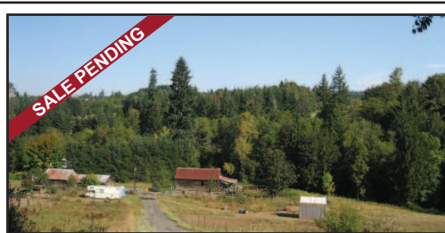
34087 Pittsburg Rd. St. Helens $340,000

On a clear day you can see forever - 23 acres, 3 bdrm, 2 bath