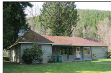
21046 Scappoose/Vernonia Hwy. $265,000 Country Home - 13.64 acres. Bring the horse - good pasture. 3 bedroom, 2 bath, library and 4-bay shop. A serene setting.