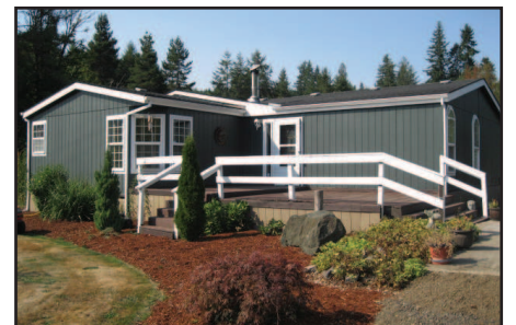
62419 Nehalem Hwy N. $275,000 Quality home has it all - 3.41 acres, gourmet kitchen w/ nook & pantry. Bring the horse - new barn and corral. 48x60 shop w/ power & water and much, much more!