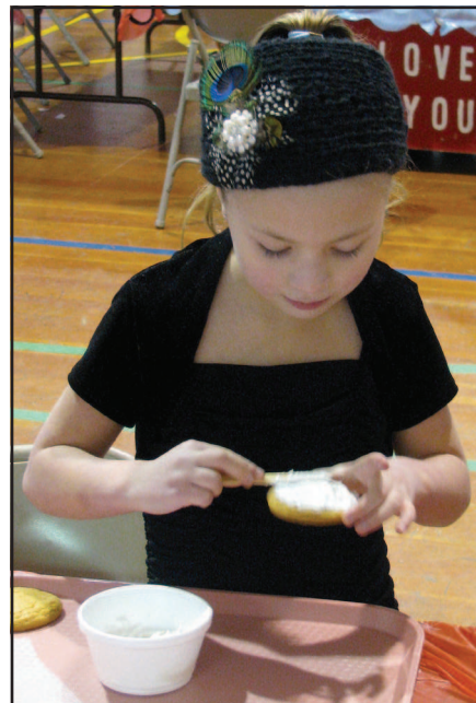
Kids and their parents had fun during the “Celebrating Families” event on December 20-22 at the Vernonia Community Church. This is the second year that the Vernonia Prevention Coalition has organized the event, which brings together numerous partners to provide fun Christmas activities for children. Kids can make gifts for the holidays, decorate cookies, make wrapping paper and cards and get holiday photos taken. Santa even showed up on Saturday. All the activities are provided for free to the families that participate.