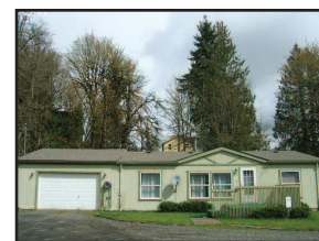
1172 Maple St: Super convenient location near city hall, library, banks and stores. Lots of upgrades in this 3 bdrm, 2 bath dble-wide that features a wood stove, heatpump w/AC, big 1 car garage, dog run, decks, trees and creek. Now just $119,000