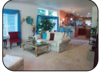
2560 sq.ft. home rated Energy Star & double insulated. 3 bdrm, 2 bath on .68 private acre w/ 3 bay garage