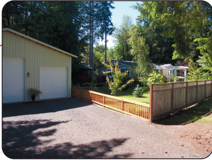
15246 Creekview Lane, Vernonia RMLS# 12062708 $274,900 www.15246CreekviewLane.com