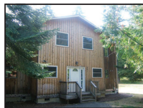
981 Fairway Ln: To Each His Own! With 7 bdrms, 2 bath, mud room, office/den & heated detached shop, everyone has a room of their own. Sitting on a .46 acre lot w/towering trees, room for a garden and in a quiet newer neighborhood you can't ask for more. $189,000.