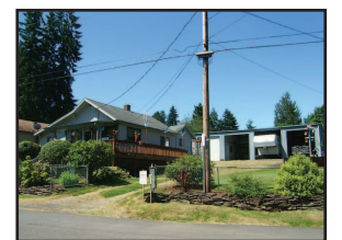
845 Riverside Dr: Workshop & 3 bay garage offers plenty of room for RV's, auto, toys, and tools. Plus a cozy well cared for 2 bdrm bungalow w/covered front porch, rear deck, pantry and gas heat all on a 1/4 acre lot that is completely chain link fenced. $139,000