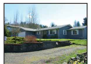
1299 E Alder: Totally move in ready. This rambling ranch w/ 4 bdrms, 2 baths plus a 2 car garage all on a large lot, it is NOT a fixer. Kitchen has oak cabinets, handy island & pantry. FR w/view off private back yard and new deck. New paint in & out. $199,500