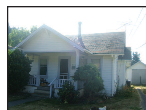
209 B Street: Charming, well kept bungalow on dead end street. Features covered front and rear porches, 2 bdrms down and 2 bonus rooms upstairs. Oversized 1 car garage with concrete floor and power plus a chain link fenced back yard. $39,000