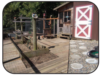
1570 sq.ft. 3 bdrm, 2 bath, wood floors, new septic tank on city water. Covered porch, raised garden beds, chicken coop, lrg shop & green house!