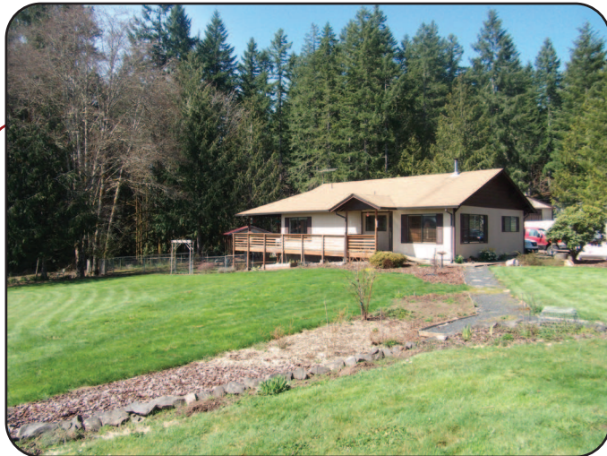
60471 Stoney Point Rd, Vernonia RMLS# 12456523 $199,900 www.GreatLittleFarm.com