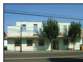
934 Bridge St: In Downtown Vernonia. Formerly a restaurant/lounge w/banquet facilities. Established location on the main street (Hwy 47) through Vernonia. Many possibilities at this great location. Priced to sell plus contract terms. $139,000