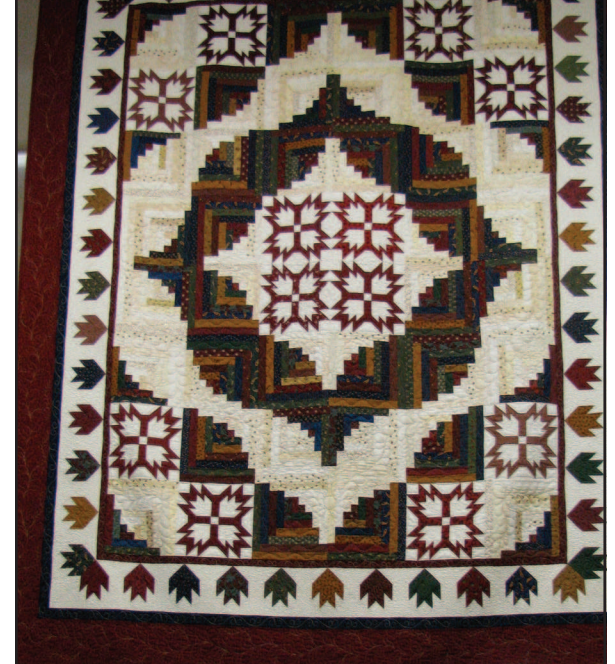
The St. Mary's Quilt and Craft Fair was held this year from September 20-23. As usual there were many quilts and crafts to enjoy, and of course great soups, pies and cinnamon rolls! It was another successful event.