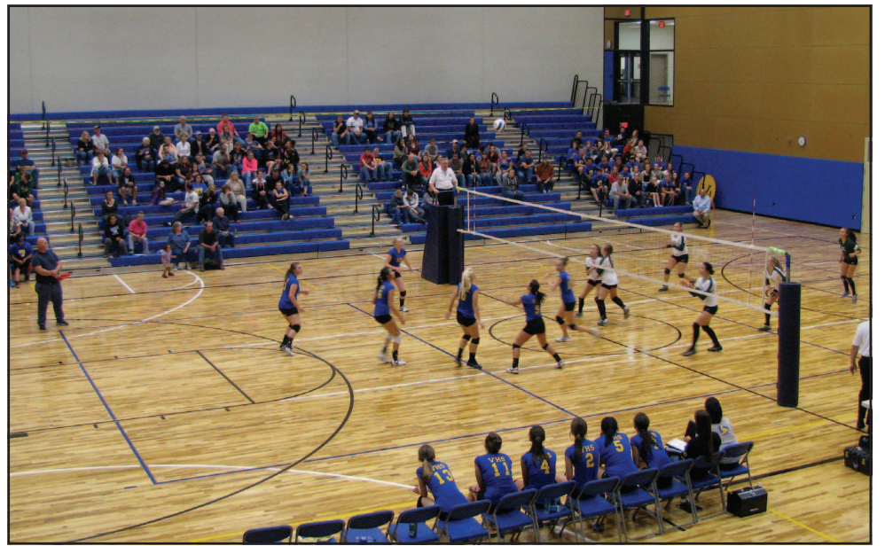
The Lady Loggers defeated Gaston on October 4th. It was the first home volleyball match in their new gymnasium with the recently installed bleachers.